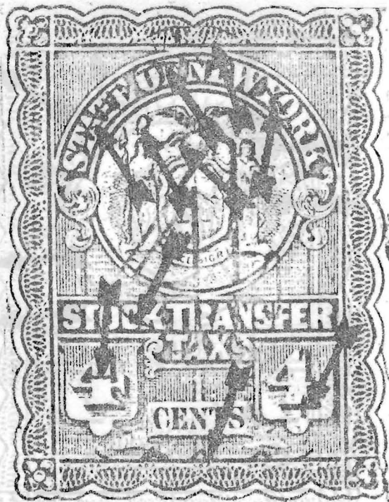
Fig. 43.- Double transfer through "STATE OF NEW YORK", "CK" of "STOCK", in "4", etc. Occurs on 4¢ (ST30, 41, 42).