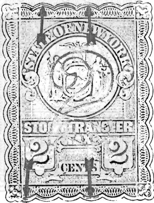
Fig. 35.- Double transfer at top and bottom on 2¢ (ST29, 39, 40).