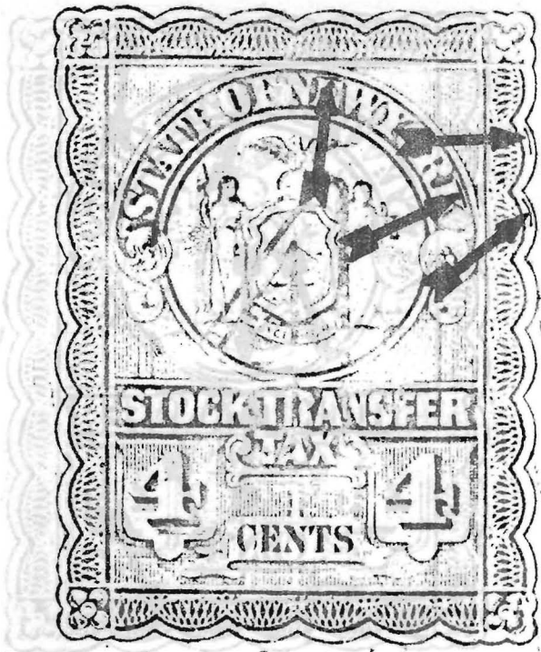
Fig. 42.- Double transfer in right frame, "E" of "NEW", and "K" of "YORK". Occurs on 4¢ (ST40, 41, 42).

Charles Hermann shows us a copy of L1b listed in Hubbard's catalog. This is one of the finest double impressions we have seen, both impressions being of almost equal intensity. The displacement of the second impression is very slight, giving an intense black but, at first glance, blurred print. This variety may be unique.