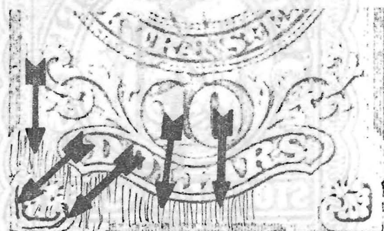
Fig. 32.- Double transfer at lower left on $10 (ST27).

Fig. 32 illustrates the only double transfer discovered to date on the $10.