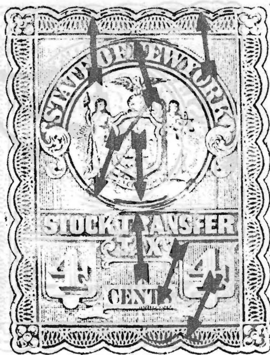
Fig. 40. - Double transfer at top, bottom, below "TS" of "CENTS", above "OF NEW", etc. Occurs on 4¢ (ST30, 41, 42).