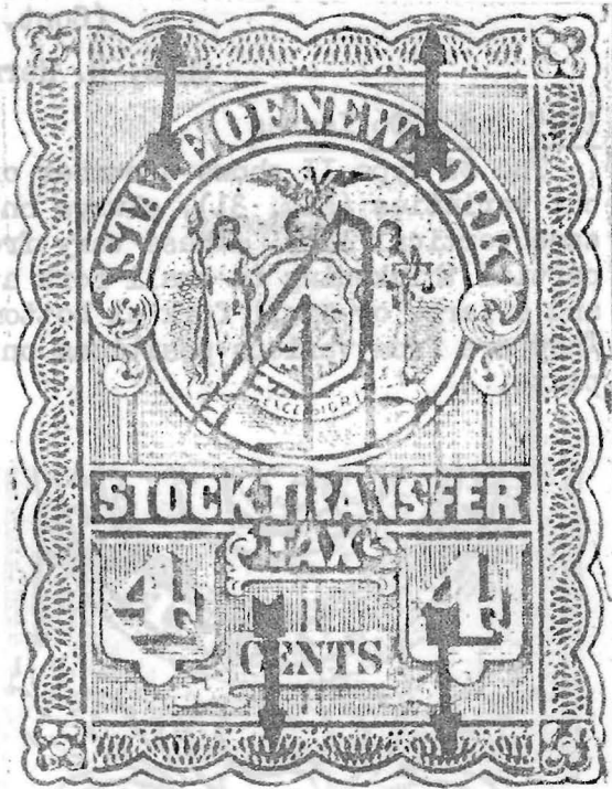
Fig. 36.- Double transfer at top and bottom on 4¢ (ST30, 41, 42).