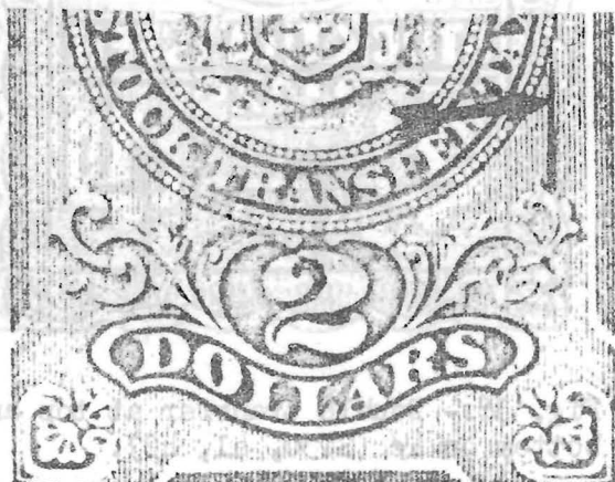
Fig. 31.- Recut on Type II $2.

The $2 Type II shows a number of recut varieties (Fig. 31), always on the same vertical line. These vary from partial thickening to small fork at top and a large or small fork at bottom. They are from various positions on the plate.