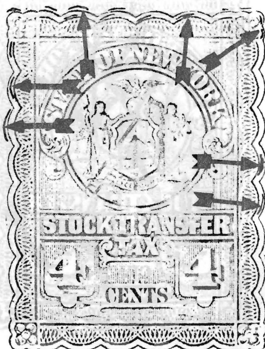
Fig. 41. - Double transfer in upper left, right, and top frame. Occurs on 4¢ (ST30, 41, 42).