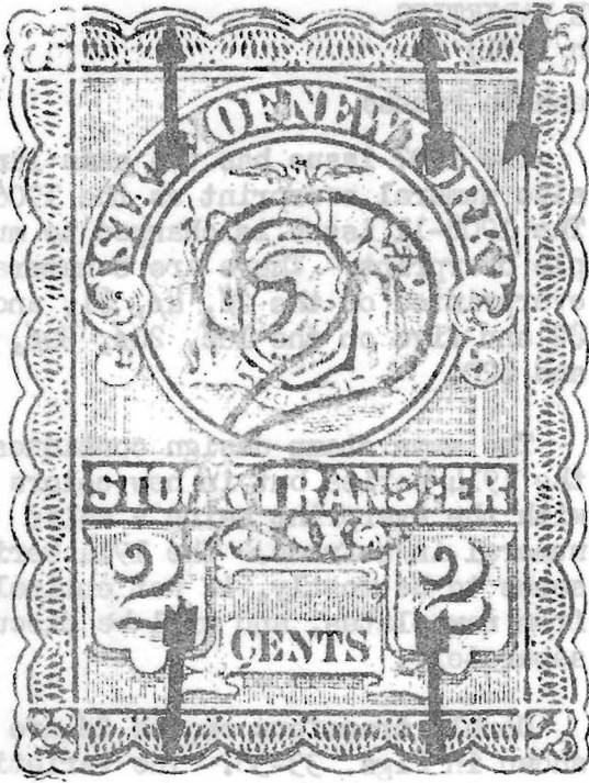
Fig. 34.- Double transfer at top and bottom on 2¢ (ST29, 39, 40).