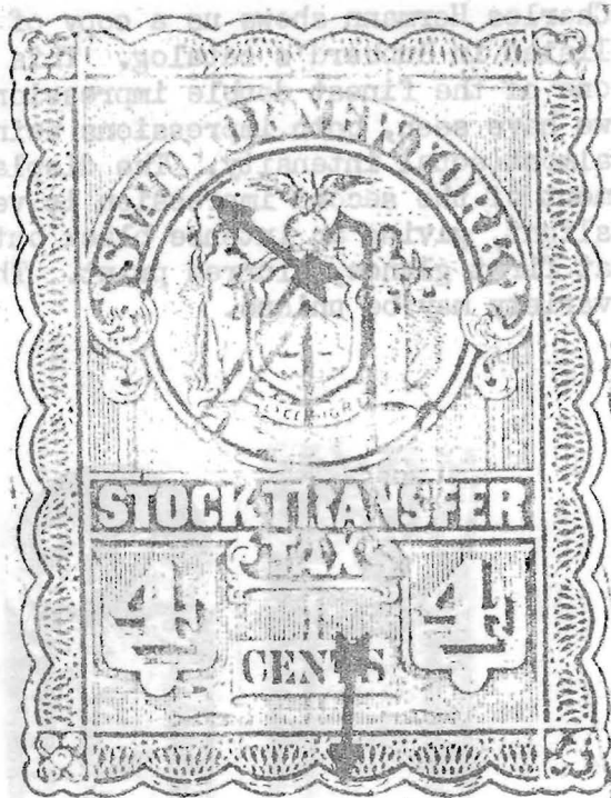
Fig. 38. - Double transfer at bottom and below "TE" of "STATE". Occurs on 4¢ (ST30, 41, 42).