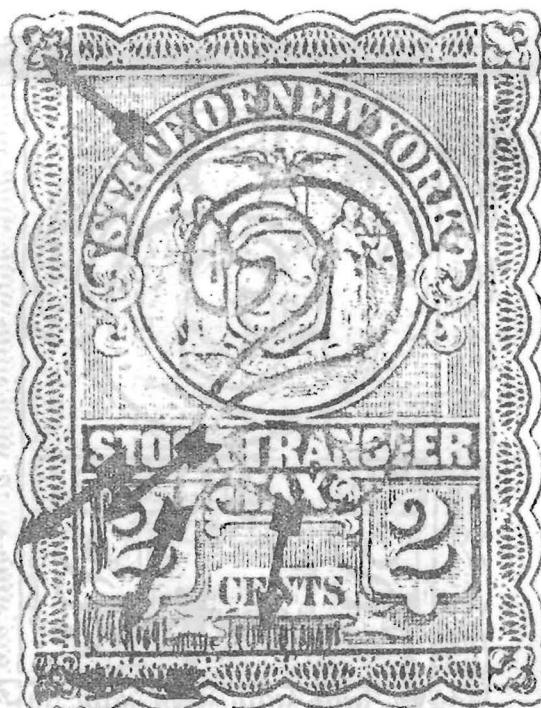
Fig. 33.- Double transfer in upper left corner ornament and in much of lower left. Occurs on 2¢ (ST29, 39, 40).

Double transfers on the 2¢ are shown in Figs. 33-36. The varieties shown in Figs. 34 and 35 are very similar but with sufficient differences that they must be two positions.