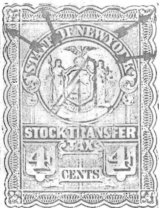
Fig. 39. - Double transfer at upper left, upper right, and top. Occurs on 4¢ (ST30, 41, 42).