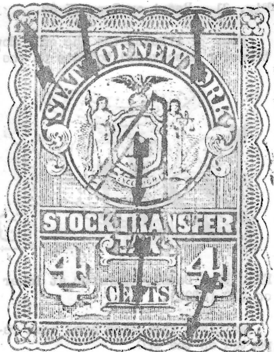
Fig. 37.- Double transfer at top, bottom below "CENTS", etc on 4¢ (ST30, 41, 42).

Double transfers on the 1907 and 1908 4¢ are shown and described in Figs. 36-43.